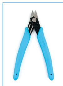
1 High Precision Shear