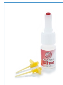
1 tube of Bead Cord Glue