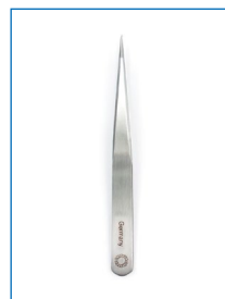
1 pair of long Knotting Tweezers