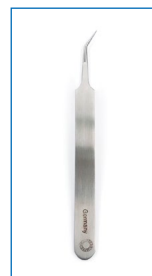
1 pair of Stringing Tweezers