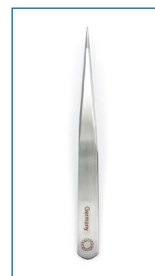
1 pair of Knotting Tweezers