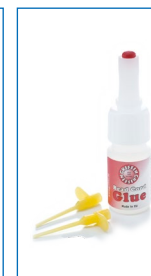
1 tube of Bead Cord Glue